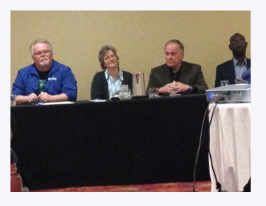
Death row exonerees' panel