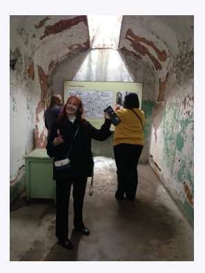
Members enjoying a tour of Eastern State Pen!